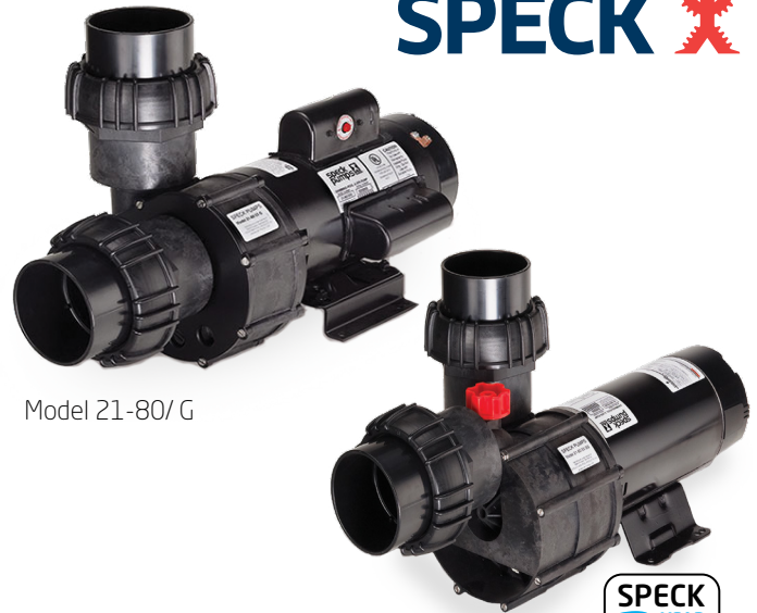
Model 21-80/ G