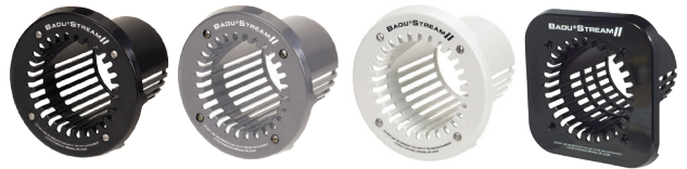
Round covers are available in black, gray and white.