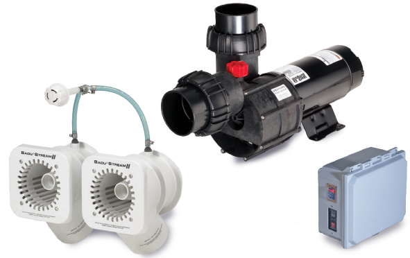
Package A (with square cover)