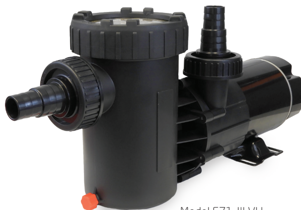
Model E71-III VH