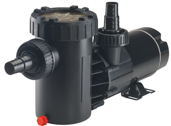
Model E71-III VH