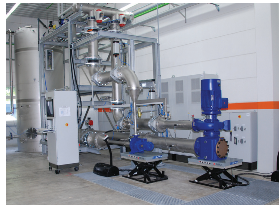
Every pump is performance-tested to factory and customer specifications.