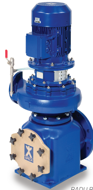
BADU Block 150/250