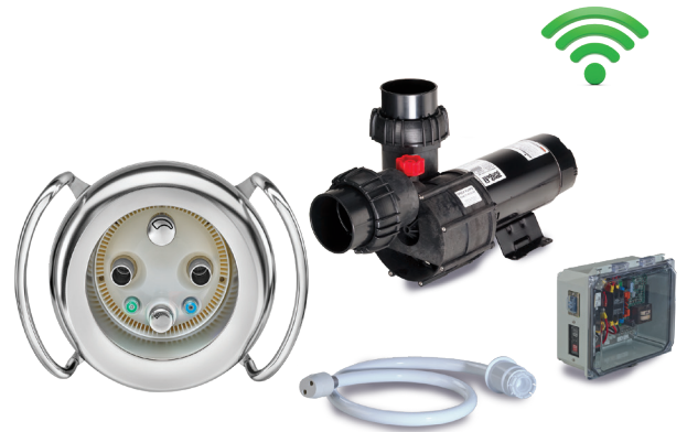
BaduJet Imperial Deluxe