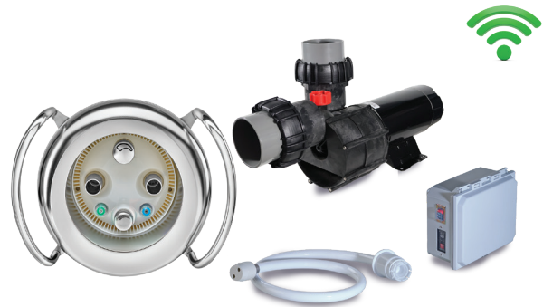
BADUJET Imperial Deluxe

Consult your physician before attempting any strenuous exercise. This product may not be challenging or satisfying for all levels of exercis