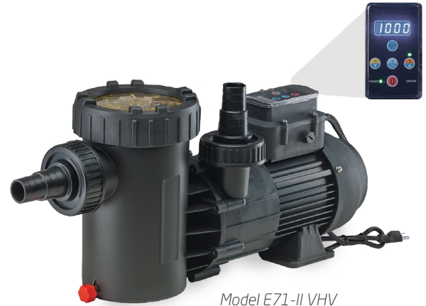
Model E71-II VHV

The final word on above-ground pump design. Dual discharge ports allow for easy conversion from cartridge to sand, while an oversized in-ground style basket allows for minimal maintenance.