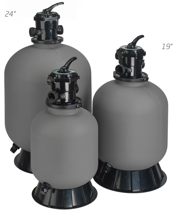
31" Filter (not Shown)